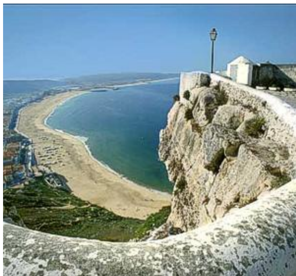
<<<<< Actual cliff

Legend has it that a nobleman having prayed in the Church mounted his horse and set off for home when the horse bolted and was heading for the cliff edge. The prayers of the nobleman for Our Lady's intercession stopped the horse which turned away from the danger. >>>>>>>>